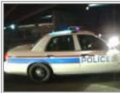
Pastor Arrested for Preaching the Gospel part 2.

http://www.youtube.com/watch?v=q8Vddo6V1sY&feature=related