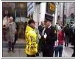
STREET PREACHERS ARRESTED IN NORWAY PART TWO

http://www.youtube.com/watch?v=bKl6xxjzXyI&feature=related