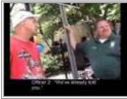
195 Seconds to Arrest-Peaceful Christian Pastor...

http://www.youtube.com/watch?v=a3MA3ue7ocE&feature=related