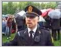
STREET PREACHERS ARRESTED IN NORWAY PART ONE

http://www.youtube.com/watch?v=PHJ8NF3_UOo&feature=related