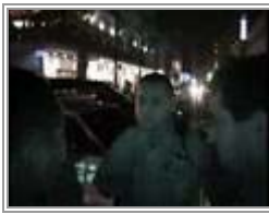
Miami Cops Arrest Street Preacher

http://www.youtube.com/watch?v=tBg4Qpt0Yjo&feature=related